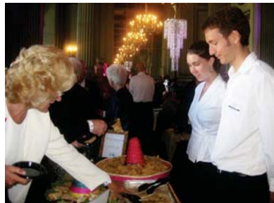
ALRP volunteers serve hors d'oeuvres at the Gala.

ALRP was a beneficiary of the Richmond/Ermet AIDS Foundation's Help Is On The Way Gala held on August 5. This spectacular variety show featured music, comedy, and dance from Broadway and Hollywood.