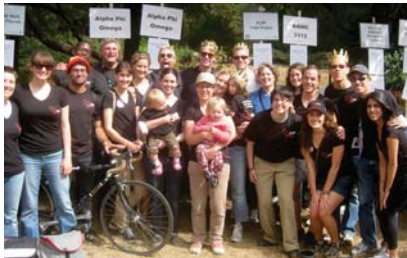
The ALRP Legal Eagles AIDS Walk Team in action!

On July 15, the ALRP Legal Eagles AIDS Walk team smashed all previous team records! 43 walkers, including 10 StarWalkers, raised a staggering $25,204. Thank you for an incredible AIDS Walk!