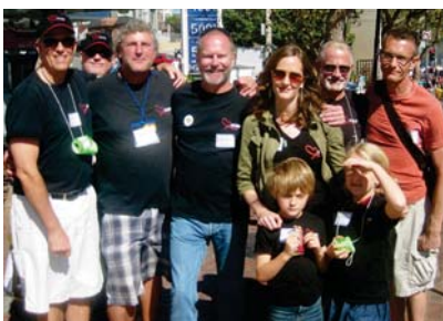
ALRP staff and friends at the Castro Street Fair

On October 7, ALRP volunteers gathered on Castro Street to welcome fairgoers and collect donations.