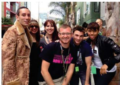
USF Pride Law students go above and beyond to volunteer at Folsom on behalf of ALRP

On July 29 and September 23, over 115 ALRP volunteers turned out for these fun leather and fetish fairs to raise funds for ALRP programs. Thank you to our amazing volunteers!