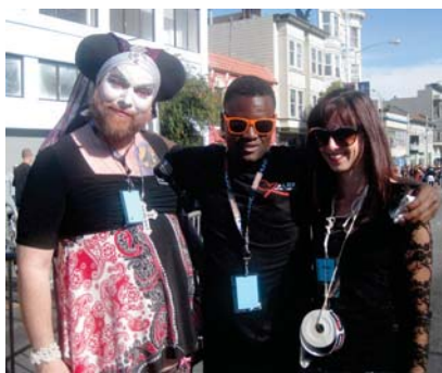
ALRP volunteers join the Sisters of Perpetual Indulgence in collecting donations at the fair gates